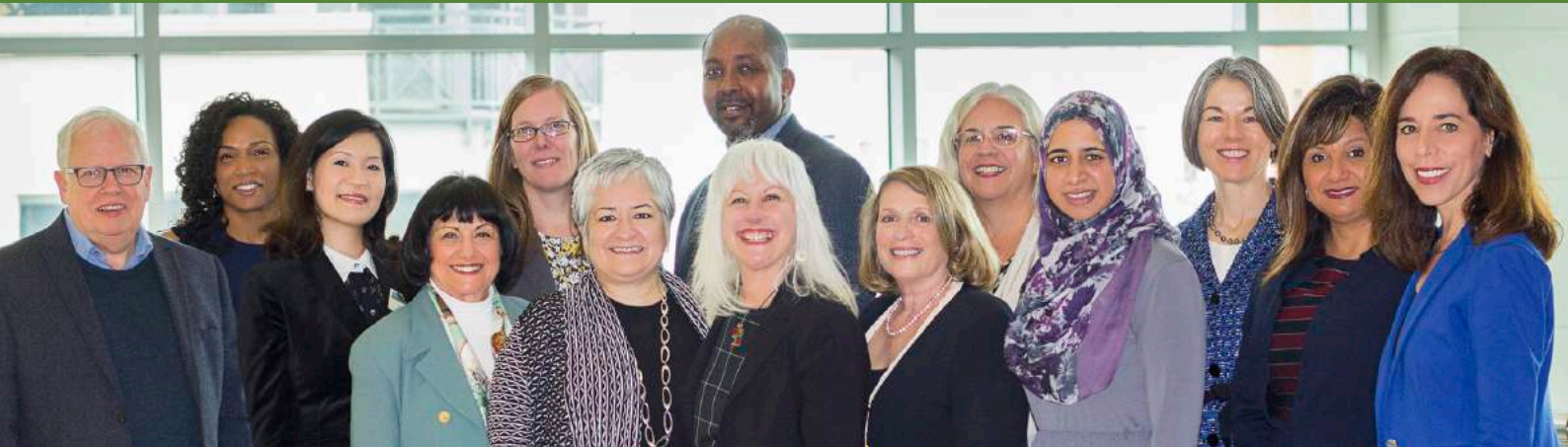
2017 Conference Organizers and Speakers for Pursuing Inclusion: Diversity in the Workplace