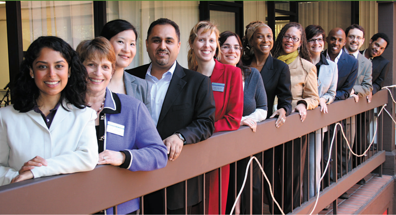
2010 Conference Organizers and Speakers for Women of Color and Intersectionality