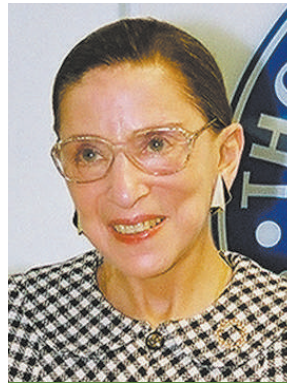
Justice Ruth Bader Ginsburg