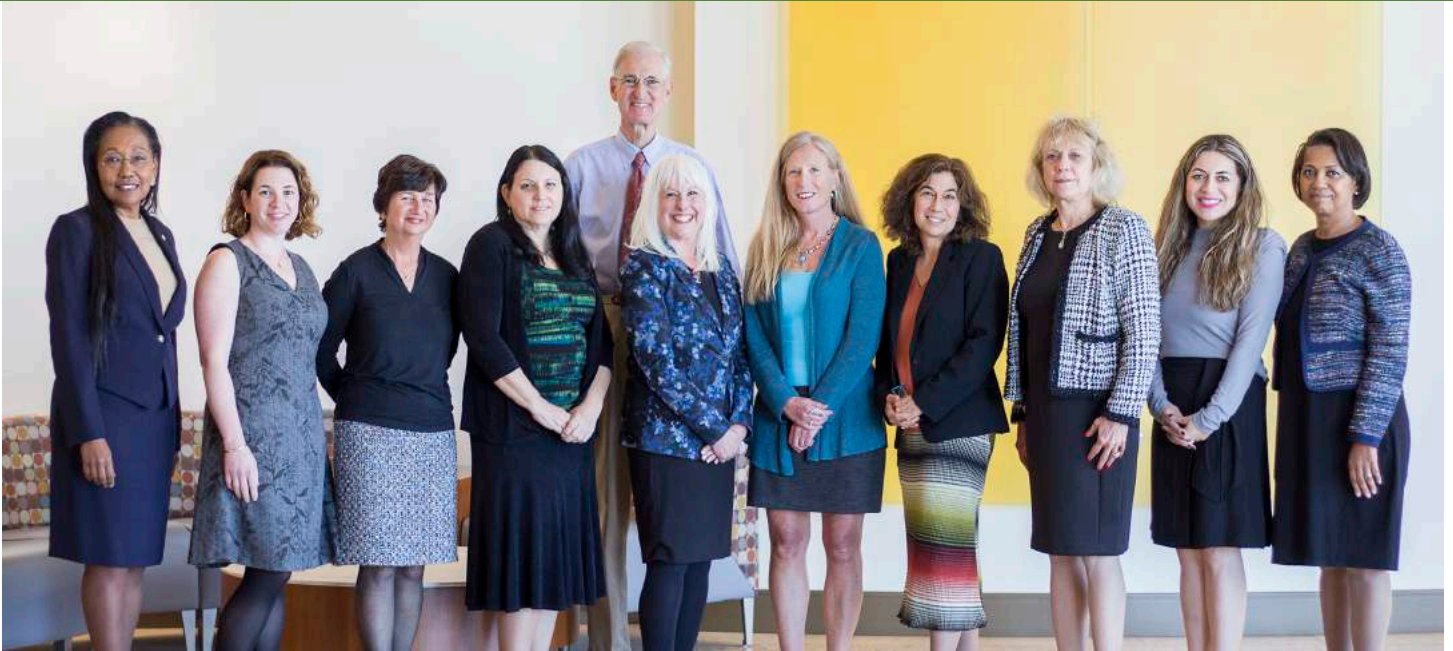
2018 Conference Organizers and Speakers for Her Place at the Bargaining Table: Gender, Negotiation and “Risky” Decision-Making