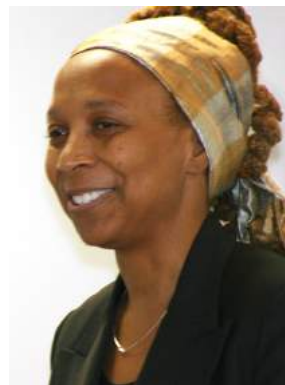
Professor Kimberlé Crenshaw