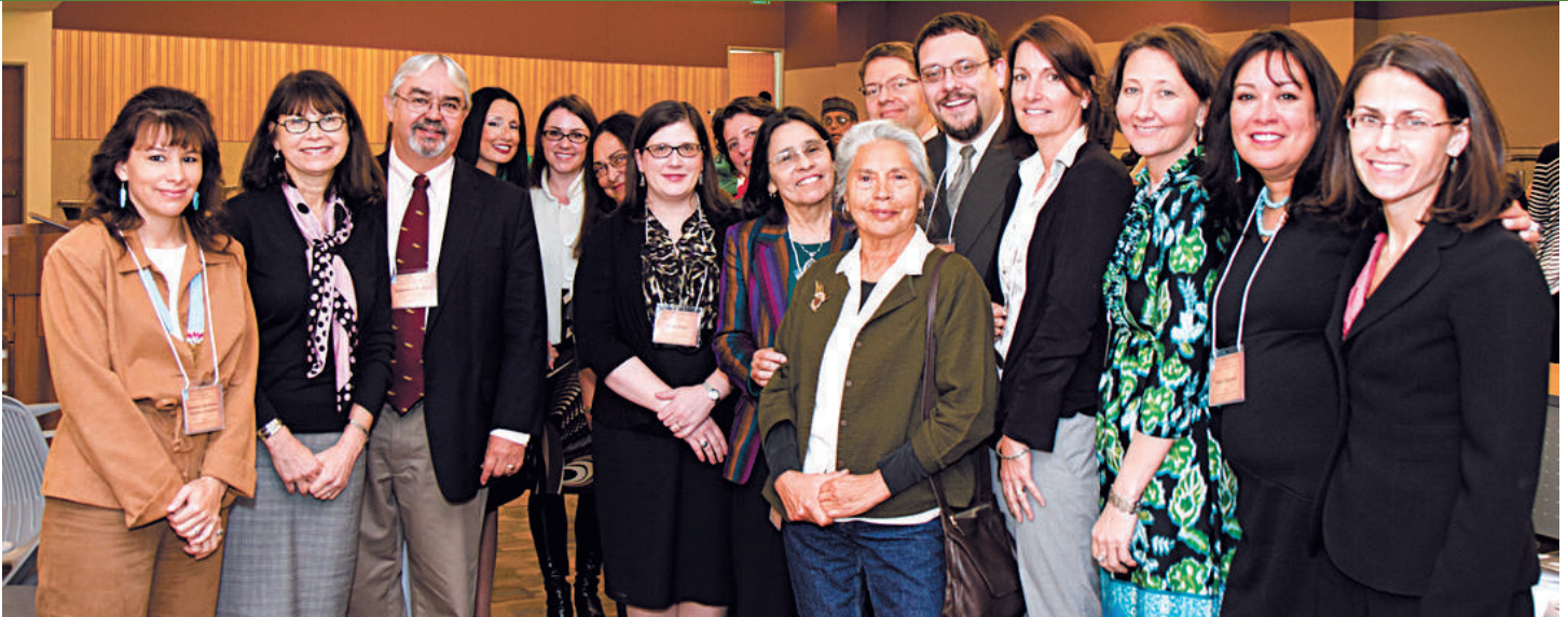
2011 Conference Organizers and Speakers for Gender Justice and Indian Sovereignty: Native American Women and the Law