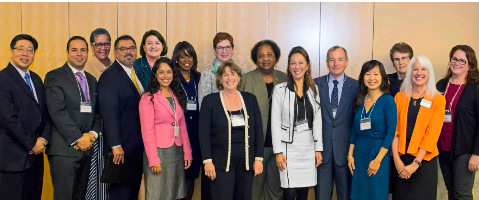
2016 Conference Organizers and Speakers for Pursuing Excellence: Diversity in Higher Education

In 2015 , the conference explored Women and the Criminal Justice System. Noted criminal defense attorney and author Leslie Abramson, who handled the Menendez Brothers trial and the Phil Spector case, delivered the Ruth Bader Ginsburg Lecture, "Using Female Strength to Your Client's Advantage." Conference speakers included judges, prosecuting attorneys, defense attorneys, civil rights attorneys, academics, and former inmates, who examined gender disparities in prison and throughout the criminal justice system.