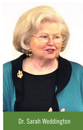
Dr. Sarah Weddington