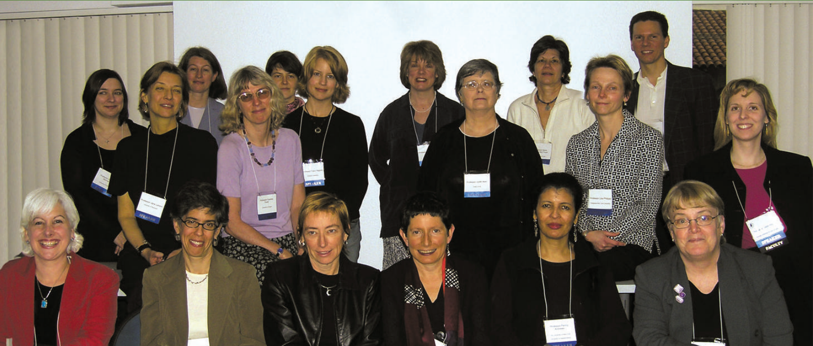
2005 Conference Organizers and Speakers for The Global Impact of Feminist Legal Theory