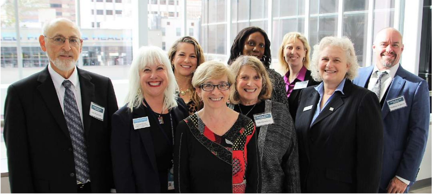
2019 Conference Organizers and Speakers for The Way Forward: Gender, LGBTQIA Rights, and Religious Liberties