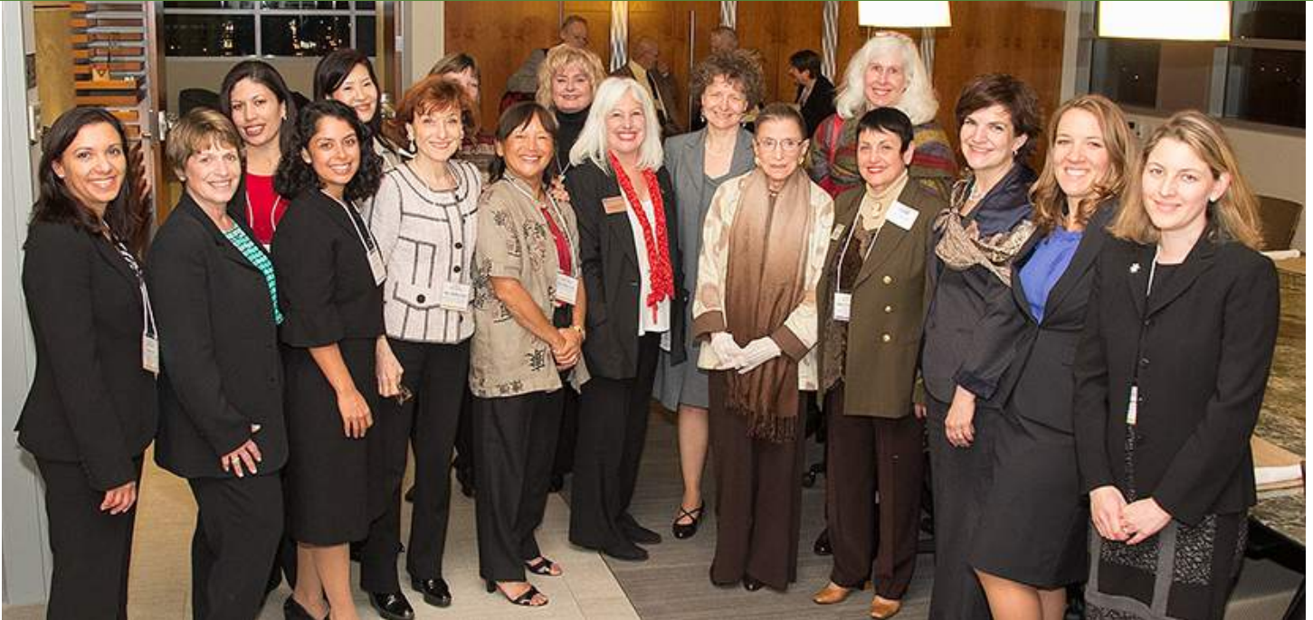
2013 Conference Organizers and Speakers for Her Honor: Women in the Judiciary