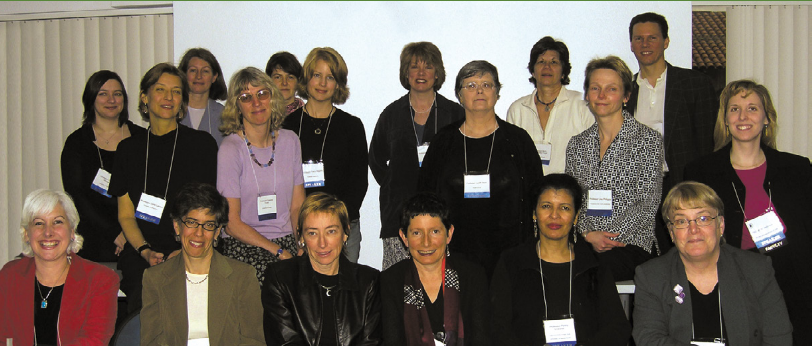
2005 Conference Organizers and Speakers for The Global Impact of Feminist Legal Theory