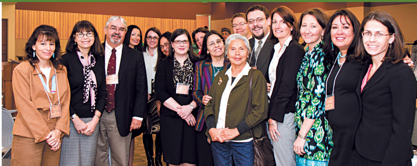
2011 Conference Organizers and Speakers for Gender Justice and Indian Sovereignty: Native American Women and the Law