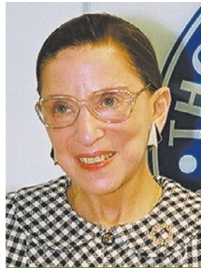
Justice Ruth Bader Ginsburg