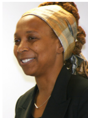
Professor Kimberlé Crenshaw