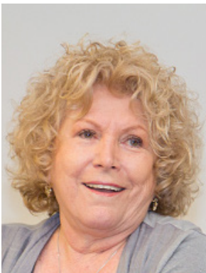
Attorney Leslie Abramson

In 2015 , the conference explored Women and the Criminal Justice System. Noted criminal defense attorney and author Leslie Abramson, who handled the Menendez Brothers trial and the Phil Spector case, delivered the Ruth Bader Ginsburg Lecture, “Using Female Strength to Your Client’s Advantage.” Conference speakers included judges, prosecuting attorneys, defense