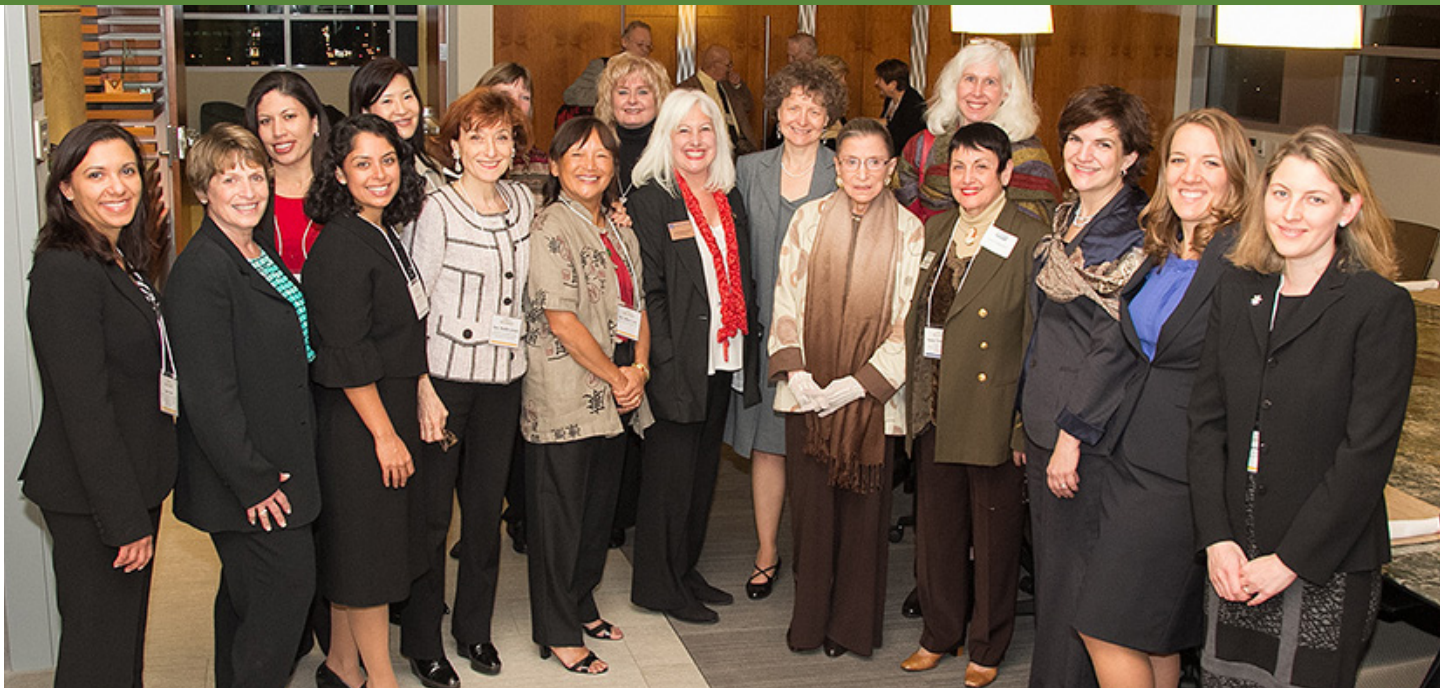
2013 Conference Organizers and Speakers for Her Honor: Women in the Judiciary