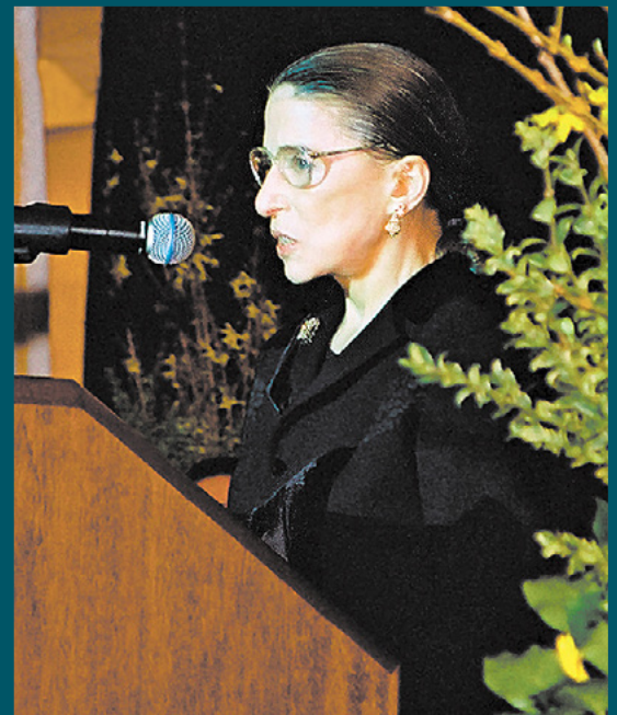
Justice Ruth Bader Ginsberg

The Annual Women and the Law Conference is unique in its early interdisciplinary approach and its commitment to bridging the gap between the teaching academy and the practicing bar.