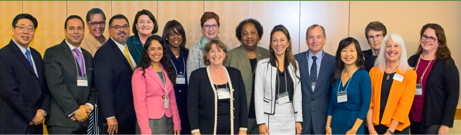
2016 Conference Organizers and Speakers for Pursuing Excellence: Diversity in Higher Education