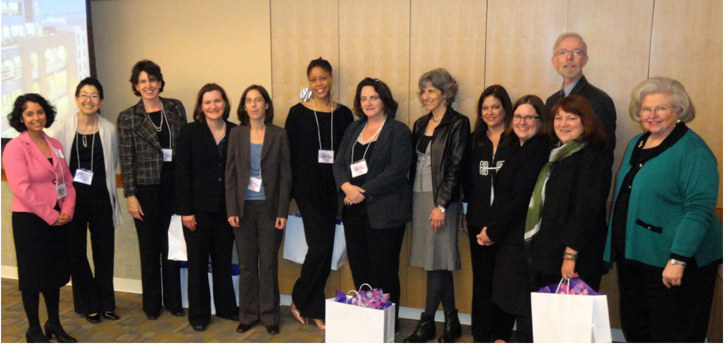
2012 Conference Organizers and Speakers for Reproductive Justice: Examining Choice and Autonomy in the New Millennium